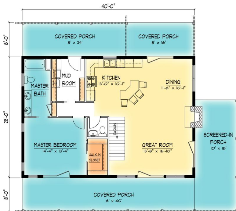
FIRST FLOOR PLAN 1,120 SQFT