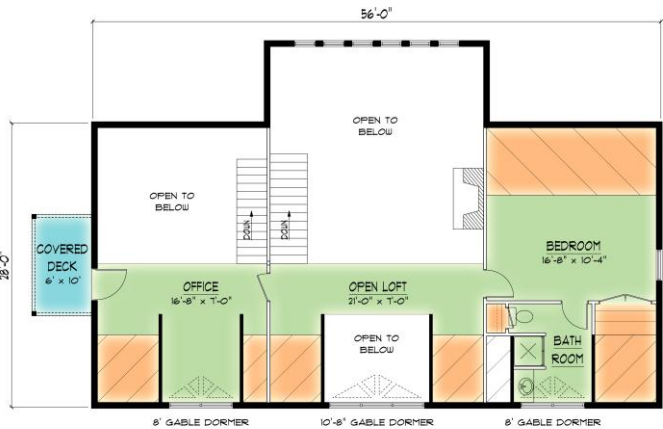
SECOND FLOOR PLAN 925 SQFT

The LAKE SIDE has an unique master suite design utilizing a private staircase to the office/library in the second floor open loft overlooking the master, along with a private second floor covered porch balcony to enjoy the early morning sunrise or sunset. The triple gable dormers all boast triangular king truss glass in the gable ends, and create a stunning entrance being vaulted in the front foyer. The mudroom is designed to allow a connection to a future three car garage where the flow is directed into the kitchen. Additionally, the double-sided see-through fireplace can be enjoyed from both the dining area and the living areas.